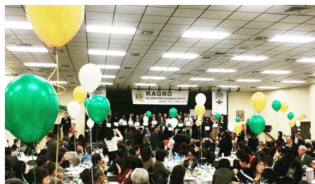
Kagro of Greater Washington DC