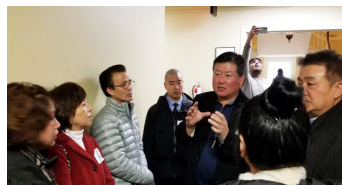
* KSM's New Year's Celebration