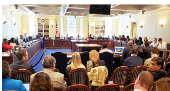
Baltimore County Sunday Liquor Sales bill