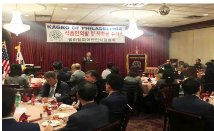
Kagro of Philadelphia