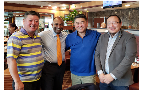
Candidate for Mayor of Baltimore City Thiru Vignarajah