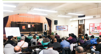
West North Ave. Liquor Bill