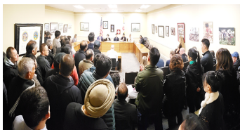
* Prince George County Supermarket Liquor Sales Permit Bill Hearing